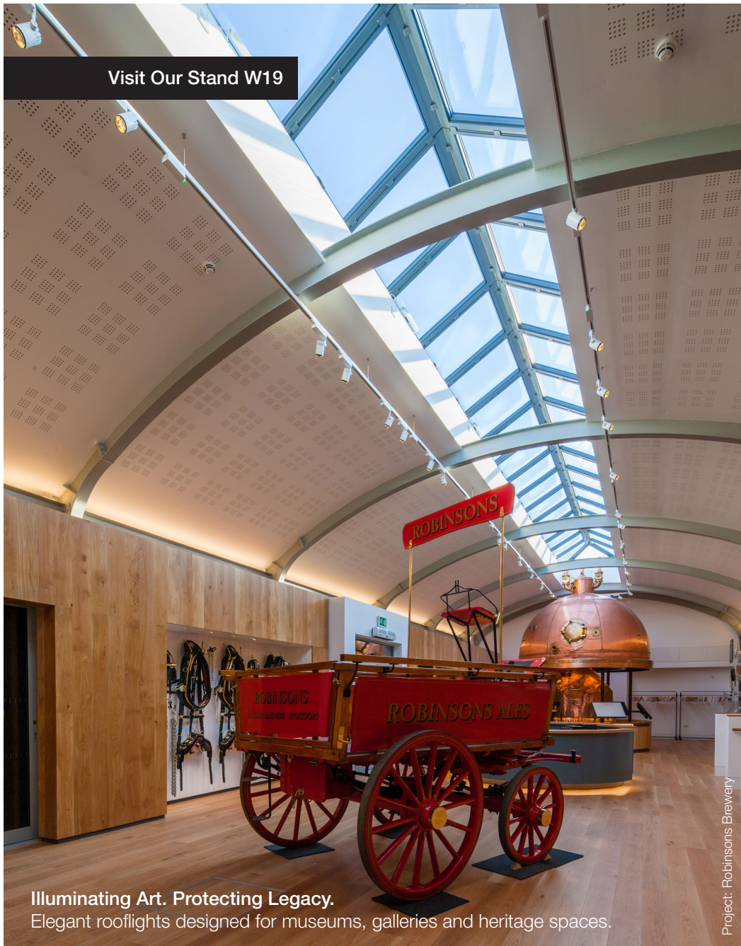
Project: Robinsons Brewery

Illuminating Art. Protecting Legacy. Elegant rooflights designed for museums, galleries and heritage spaces.